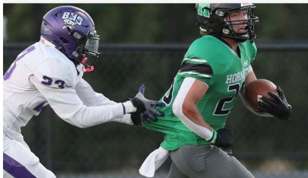
Highland's rushing attack shouldn't miss a beat once again this season.